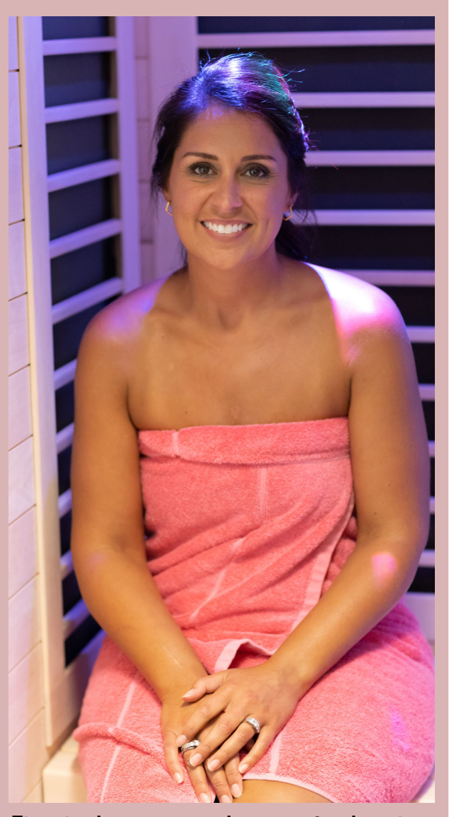
Time in the sauna can be great for detoxing.